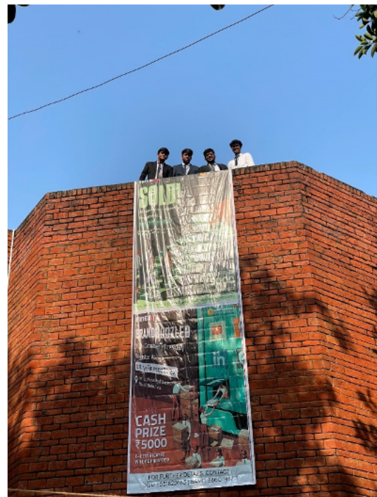
Event Poster's Flex in College Campus