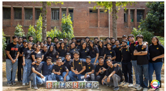
20th April 2023, 12:30 PM Bizkrieg's Marketing Campaign in College

Link for Bizkrieg'23 Registration Form: https://forms.gle/SG9SNRouLuXScY4h8