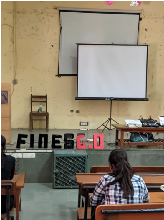
Seminar Hall 18 th October 2022