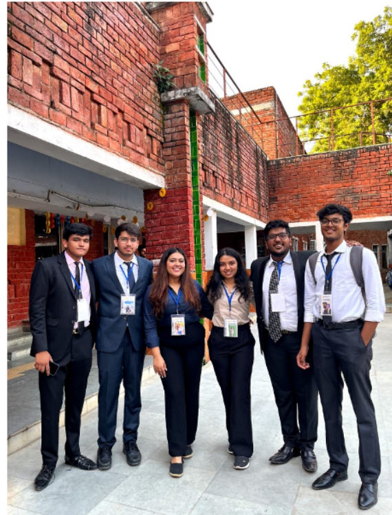
FIC Admin outside Seminar Hall