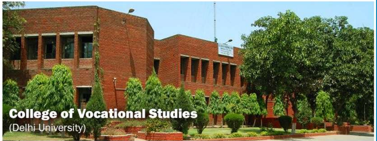
College of Vocational Studies (Delhi University)