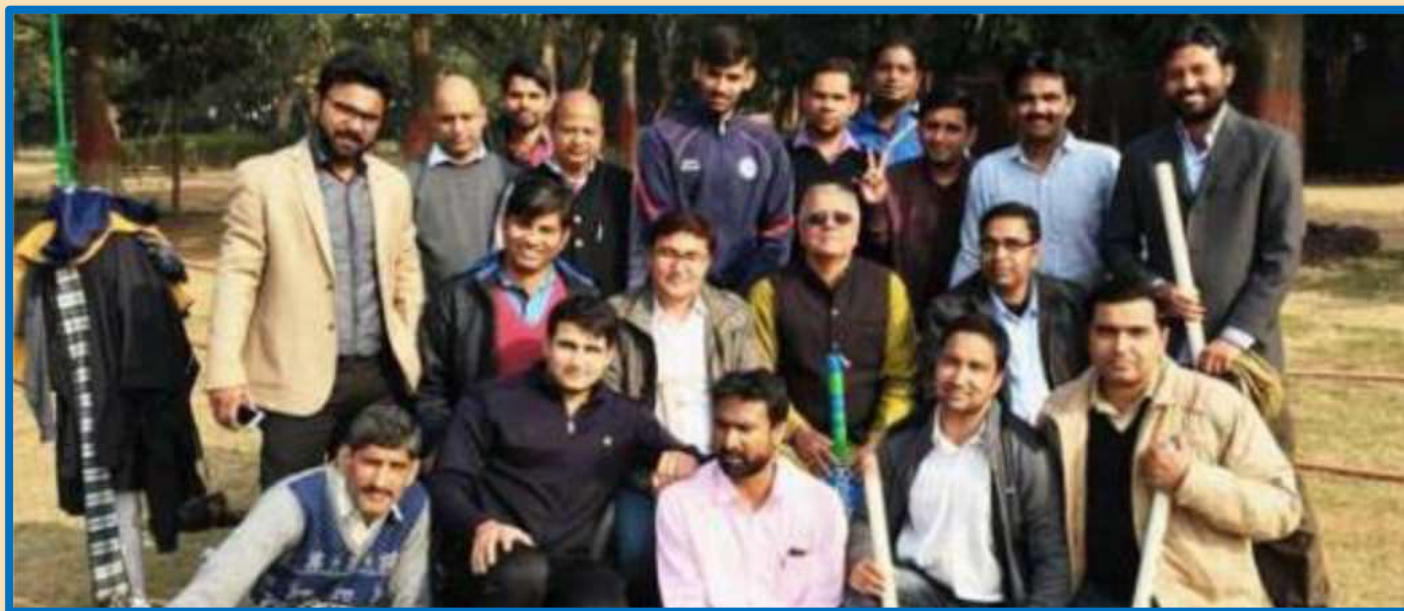
Teaching and Non-Teaching Members of CVS on the Sports Day.